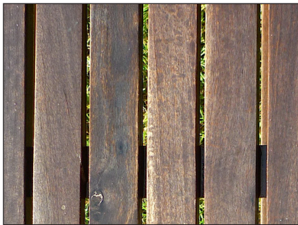
Timber prior to cleaning